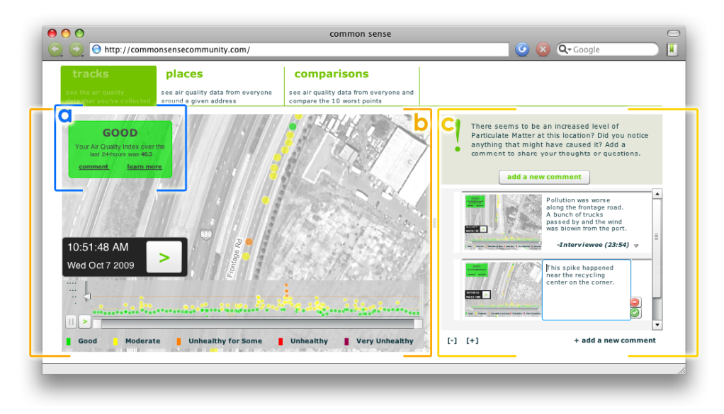
Figure 4. The Common Sense Community Site showing data collected by a single user. The My Exposure widget (a) and Tracks visualization (b) are visible along with the commenting panel (c).

a single aggregated measure of the pollutants measured by a participant's sensor, normalized over time to the EPA's Air Quality Index (AQI) [22]. (Because many people are not familiar with raw pollutant concentrations, all of the visualizations on the site also use the AQI color encodings and category descriptors – "Good", "Moderate", "Unhealthy for Sensitive Groups", "Unhealthy", "Very Unhealthy", and Hazardous" – in addition to providing actual values).