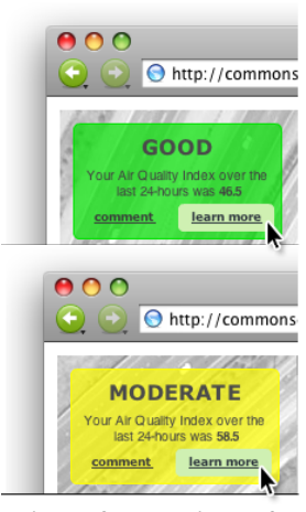
Figure 3. Two views of the My Exposure application.

The first application provides a widget that helps users answer one of the most common questions we observed in our fieldwork: "What is my exposure to a pollutant?" Many of the community members we interviewed suffered from allergies or respiratory disease exacerbated by the poor air quality in their neighborhood, and expressed a desire for tools that would help them gauge and mitigate their exposure. To meet this need, we developed the My Exposure widget (Figure 3, Figure 4a). My Exposure shows