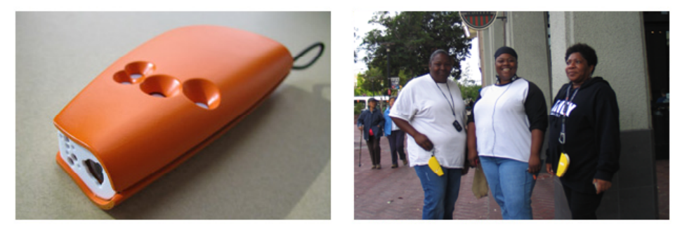
Figure 1. A personal air quality sensor (left). Community members with sensors (right).

through collaboration between locals and experts [4]. For example, while sensing systems may be able to detect the presence of a pollution source, local insight may be required to actually identify the source or reveal sensitive populations affected by it.