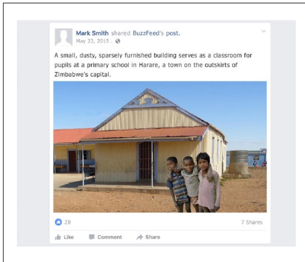
Figure 4. Mockup for Condition #19: A Facebook post allegedly created by BuzzFeed and shared by a generic person, Mark Smith. The image was composed by layering three separate images to depict a school in Africa.

political event, scientific discovery, natural disaster, and social issues. The images depicted (1) a bridge collapse in China, (2) a gay couple accompanied by their children, 3) genetically modified mouse with a cat's head, 4) a school in Africa, (5) a bombing in Syria, and (6) a Hispanic politician meeting with students. A short textual description