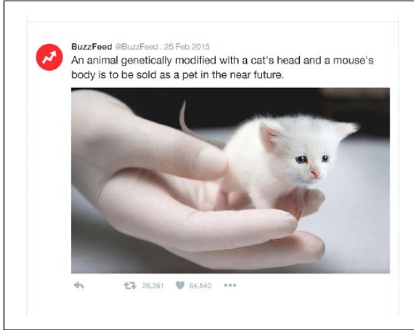
Figure 3. Mockup for Condition #18: A fake Twitter post allegedly created by BuzzFeed. The image was composed by layering two separate images to create a cat-mouse chimera.