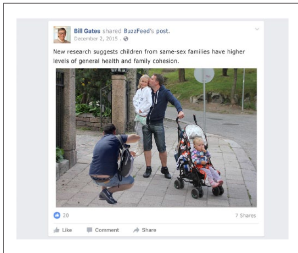
Figure 2. Mockup for Condition #21: A fake Facebook post allegedly created by BuzzFeed and shared by Bill Gates. The image was composed by layering three separate images.

image manipulation techniques and methods (elimination, retouching, and composition identified in Kasra et al., 2018). The images were fake in that the content of each composition was purposefully cropped, changed, combined, or repaired. Misattribution (presenting an untouched image in an unrelated context or under false pretense) was not tested in the current study. The content of these images ranged from political portrayal,