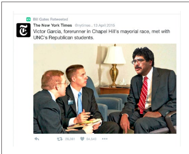
Figure 6. Mockup for Condition #8: A fake Twitter post purportedly created by the New York Times and retweeted by Bill Gates. The image was composed by layering two separate images to show a politician meeting with students.

accompanied all conditions. The captions provided brief textual information about the content depicted, similar to how images are shared and viewed on the Web.