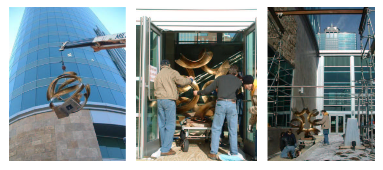
Figure 13: (a) Transport around the H&R Block building, (b) through its lobby, (c) to the courtyard.

Finally, in mid January the sculpture was finished and could be shipped to Kansas City. In the morning of January 18, 2007 we picked it up from the loading dock at H&R Block, carefully transported it around the building (Fig.13a), and maneuvered it through the main entrance. It cleared the main entrance door (Fig.13b) by just two inches! We wheeled the sculpture through the main lobby to the courtyard in the back of the building, where a stainless steel pedestal and a scaffolding with a small crane were waiting (Fig.13c). After a few anxious moments, due to some difficulties with the mounting bolts, Pax Mundi II was in its designated location (Fig.14a,b).