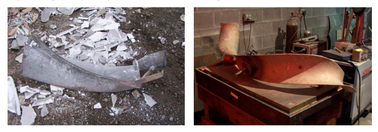
Figure 10: (a) A raw cast piece after ceramic shell has been removed; (b) two of the cast pieces welded together.

The individual pieces, of which there were twenty for Pax Mundi II , are cleaned and freed of the extraneous sprues and risers. Then the assembly process begins. Some of the smaller pieces are assembled into the U-shapes of the original master patterns. Then the overall assembly process continues in a bottom-up manner, starting from the point of support (Fig.10b), and progressing in a symmetrical manner to guarantee perfect symmetry and balance of the overall sculpture.