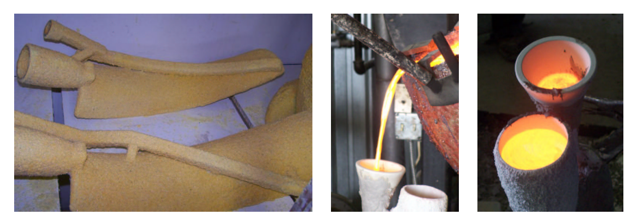
Figure 9: (a) Ceramic shell around wax copies; (b) casting process; (c) cooling bronze in the risers.

Reinmuth Bronze Studio [5] was selected to cast the pieces and assemble the final sculpture. It turned out that the milled master patterns, the smaller of which is shown in Figure 7b, were still too large for convenient handling in the bronze foundry. Thus Steve Reinmuth cut the smaller U-shape into two halves, and the larger master pattern into three pieces. Before cutting the master patterns apart, Reinmuth made a special jig that would allow him later to recreate those U-shapes perfectly from the individual pieces, even though there were no alignment tabs at the extra junctions introduced by him.