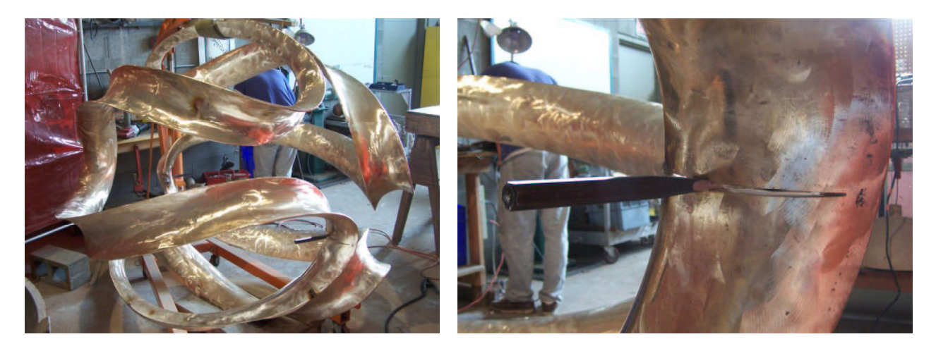
Figure 11: (a) Adjusting the overall shape (b) by cutting the ribbon partly and infilling more material.

Since the Pax Mundi II sculpture is essentially one long loop that is supported at just one point, the top part of this heavy ribbon sagged by almost one foot under its own weight. To compensate for that, Reinmuth had to pre-distort the shape during the assembly process. He hung the sculpture upside-down and let it elongate under its own weight (Fig.11a). He enhanced that elongation by cutting several slits into the ribbon (Fig.11b) so that some tight bends could open up. Then he refilled the enlarged slits with bronze welds. This locked in an elongated state of the sphere, which then settled to an almost perfectly spherical shape when the sculpture was put back into is normal position.