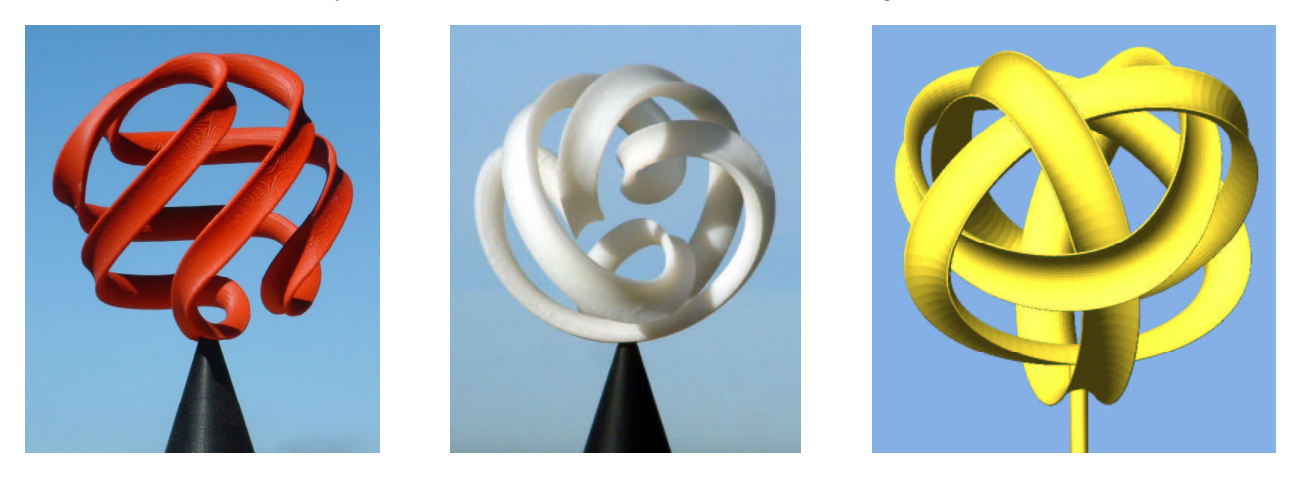
Figure 5: Different sweep paths: (a) Altamont [8]; (b) Music of the Sphere [3]; (c) Chinese Button Knot.

The next step of generalization lets the sweep path deviate from the surface of the sphere. Collins has already carved a sculpture in this category, called Music of the Spheres [3]. Séquin's modeling environment could easily be extended to capture this particular sculpture; he just had to use a more general 3D curve editor to produce the original sweep curve. The path of Music of the Spheres stays mostly on the sphere; it just makes three excursions that dive into the interior of the sphere to form three additional loops (Fig.5b). With the same generator we can also produce more complicated 3D paths – for instance some that are truly knotted, such as the Chinese Button Knot (Fig.5c).