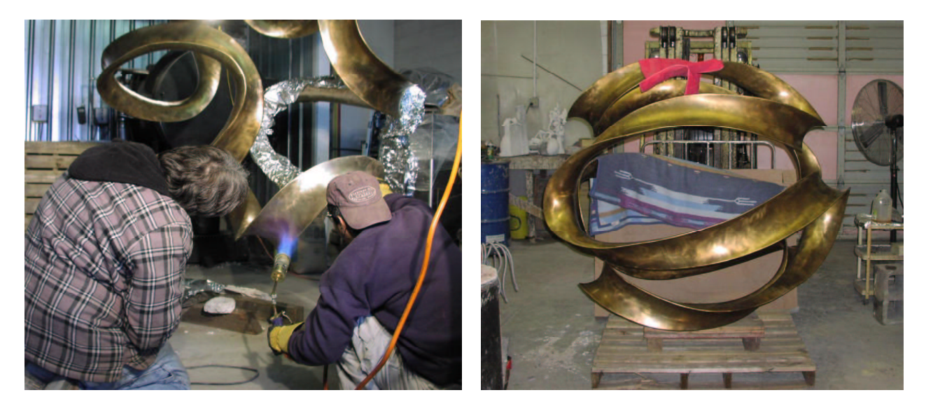
Figure 12: (a) Applying patina to the surface. (b) Pax Mundi II ready for shipping

applied with a judicious combination of heat and chemicals (Fig.12a). This color is protected from further oxidation with a thin coating of wax. As long as that coating is refreshed every few years by rubbing over the whole surface of the sculpture with a block of wax on a hot day, it should maintain its current color (Fig.12b) for a very long time.