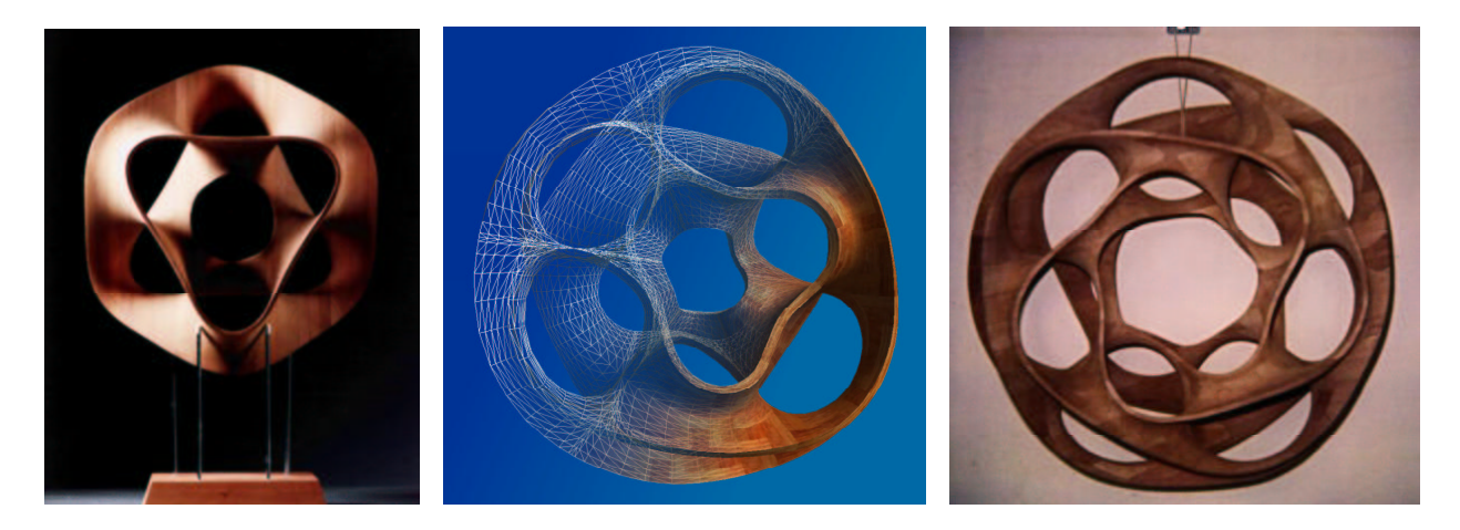
Figure 1: (a) Hyperbolic Hexagon, (b) Hyperbolic Hexagon II, (c) Heptoroid or Hyperbolic Heptagon II.