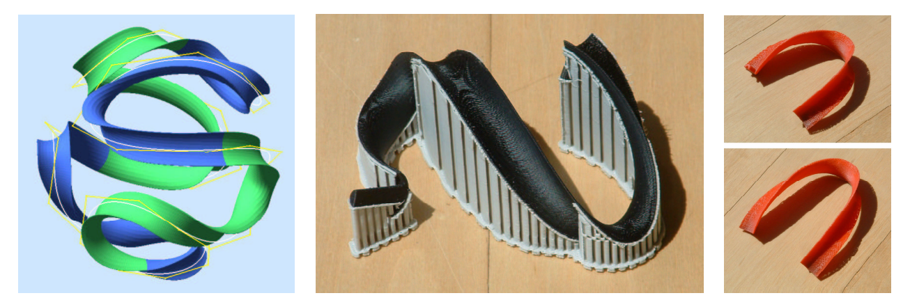
Figure 6 : (a) Pax Mundi emulation with four identical S-shaped segments; (b) prototype of a single master segment; (c) S-shaped segment split into two U-shaped parts.

welding together the individual ribbon sections in a perfectly straight continuous manner would be difficult, alignment tabs were added at the joints. These allow Reinmuth to clamp together the individual pieces in perfect alignment during the assembly process. One of these junctions had an extra large tab (Fig.7b) which is kept as an integral part of the assembly and becomes the support of the sculpture on its pedestal.