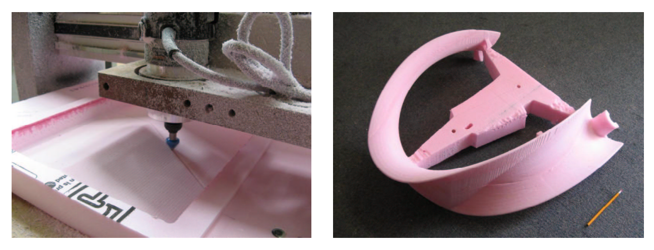
Figure 7 : (a) The milling machine used to produce the master patterns; (b) the smaller U-shaped master segment obtained by CNC milling (Photos supplied by Joe Valasek at heartwoodcarving.com).

Reducing the number of master patterns and molds that need to be generated is an important economic consideration, since it is a relatively expensive and time consuming part of the process. The machined master patterns are used to make negative molds of plastic and silicone, which in turn are then used to cast multiple positive copies in wax. These wax replicas of the master shape are then sacrificed in an ordinary investment casting process, which creates the four bronze copies needed to assemble the whole sculpture.