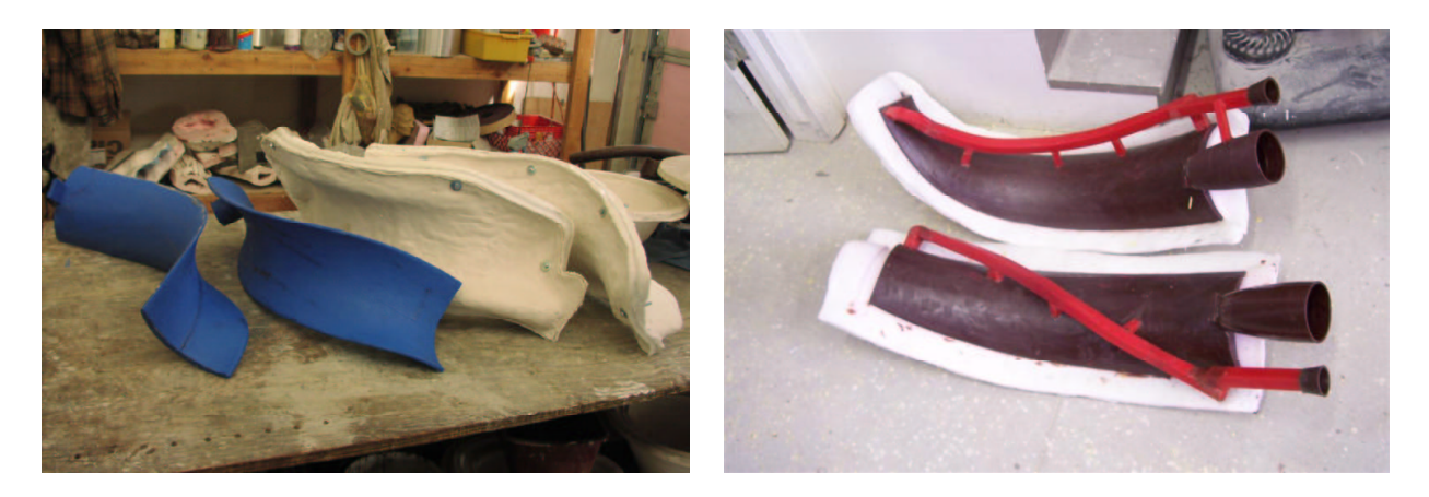
Figure 8: (a) Two sub-segments of the partitioned U-shaped master patterns and their molds; (b) two wax copies of such sub-segments with sprues and risers.

piece. By cutting that shape at the inflection point, we obtained two much flatter U-shaped sub-master patterns (Fig.6c) that could just fit into the machine. Extra alignment tabs were added (Fig.7b) to accommodate the extra junctions and to help in the final assembly.