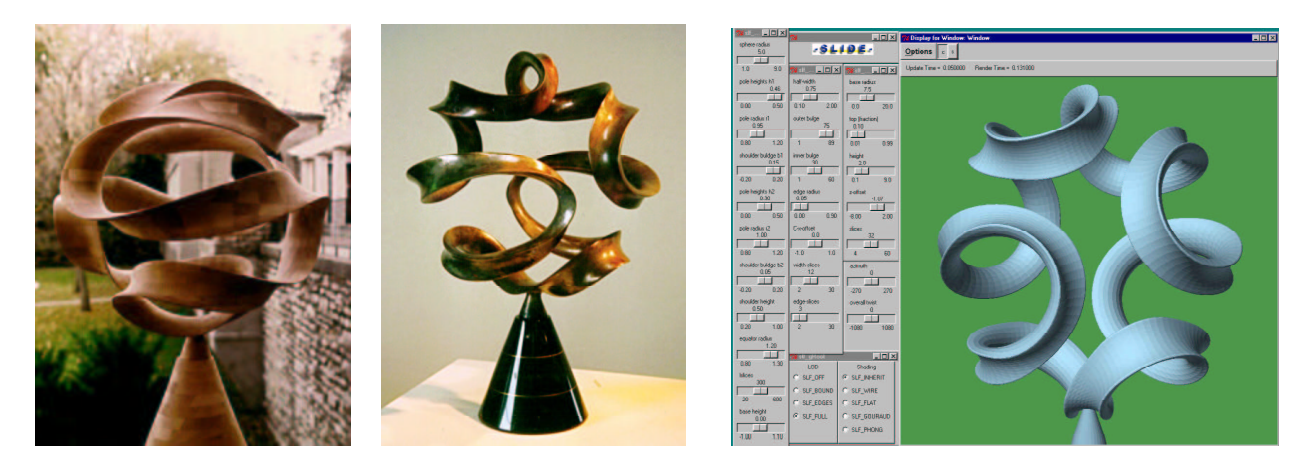
Figure 2 : Pax Mundi by Brent Collins (1997): (a) wood master, (b) bronze cast by Steve Reinmuth; (c) emulation with Séquin's Gabo Sweep Generator programmed in SLIDE [10].

In 1997 Collins also carved Pax Mundi (World Peace) , using a completely different geometrical paradigm [2]. This was an undulating ribbon skirting the surface of a two-foot virtual sphere (Fig.2a,b). Séquin was so taken by this sculpture that he decided to create a computer program that could emulate this shape and perhaps make other sculptures similar to it. The scope of Sculpture Generator I was much too narrowly focused; thus a completely new program had to be devised to capture the shape of Pax Mundi for this purpose (Fig.2c). At this juncture, the first and conceptually most challenging step is to understand the sculpture to be captured in terms of a broad enough paradigm, so that it can be easily modeled with convenient parameters, and so that the program lends itself to the generation of a wide variety of other related sculptures. From the onset it was clear that Pax Mundi should be modeled as a generalized sweep along a guide curve embedded in the surface of a sphere – following Collins' original concept. It was less clear how the sweep curve itself should be parameterized.